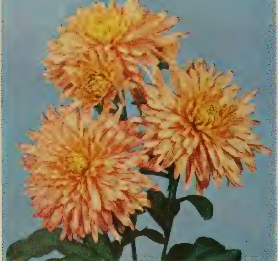
ADMIRATION. $1.00 each; 3 for $2.50